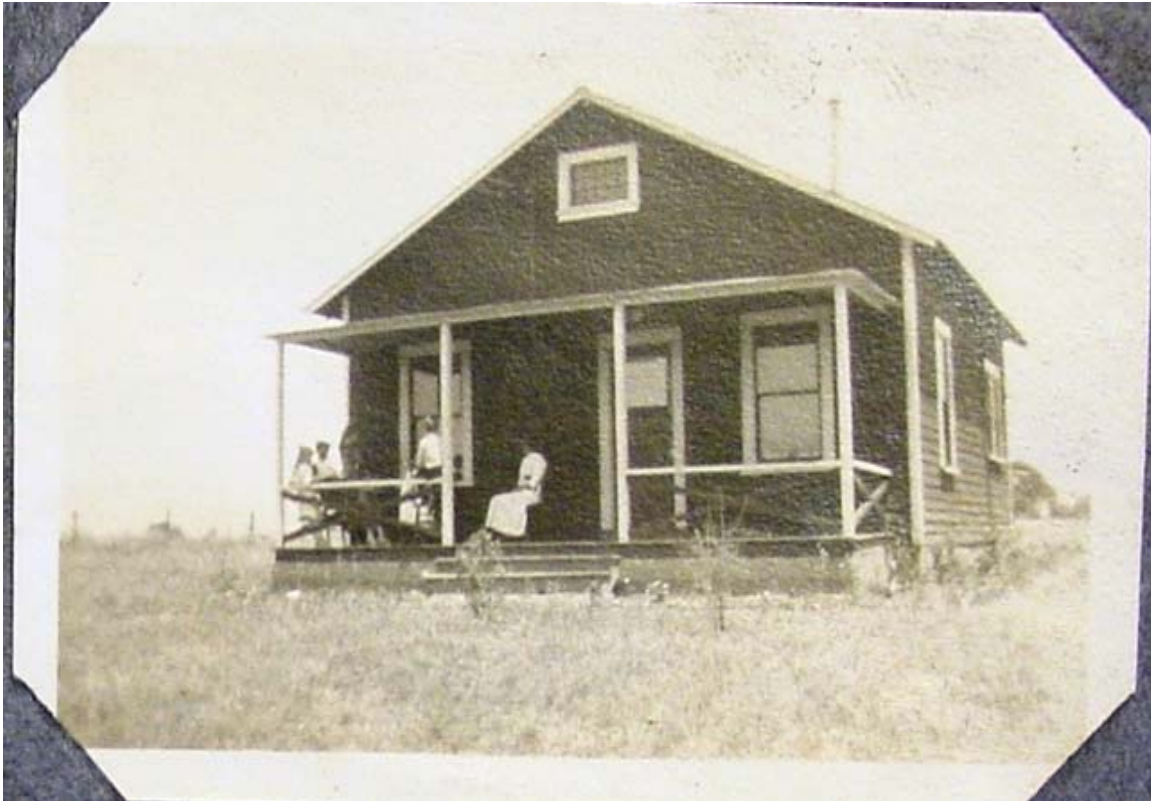
Ranch house, from the west

L: This would have been earlier, when they first bought the place [1904]. Actually this is the road off Broadway down to the ranch. My father said before too long they'd chop those trees down because they were going east and west and putting all the shade on the fields where they wanted to grow stuff. [no copy of this photo in this document—shows trees along the driveway to the house]